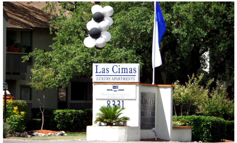
Entrance 8331 Fredericksburg Rd.