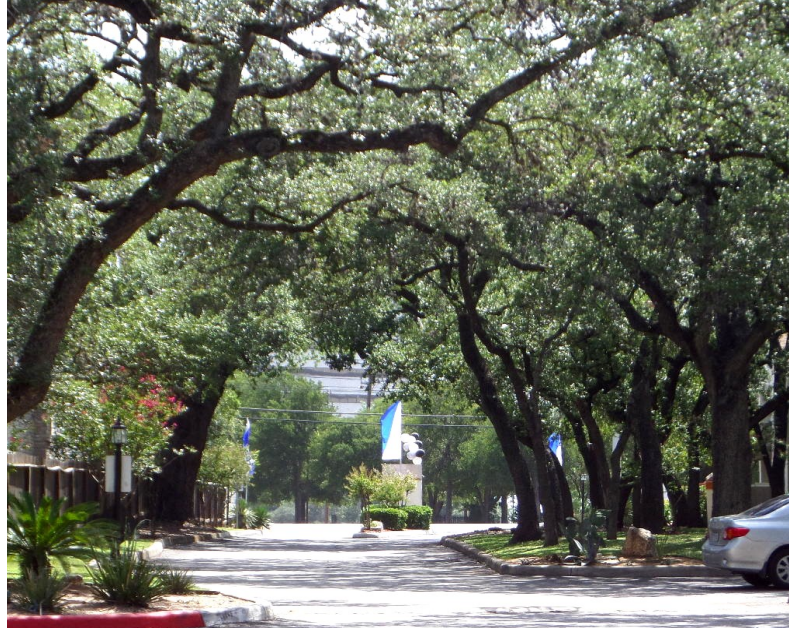
View From Building to Entrance at Fredericksburg Rd.