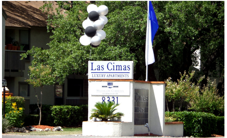
Entrance 83331 Fredericksburg Rd.