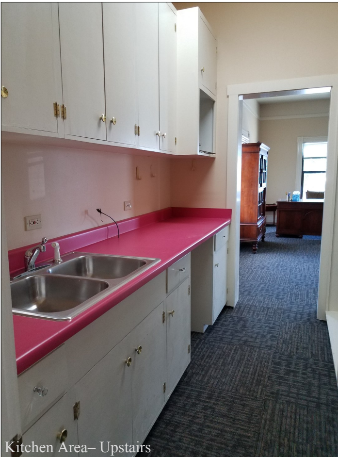
Kitchen Area- Upstairs