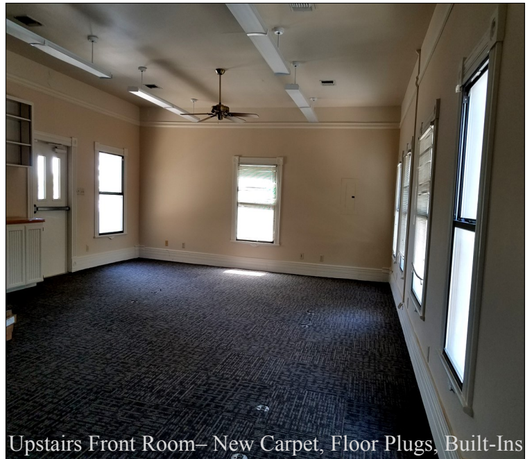
Upstairs Front Room- New Carpet, Floor Plugs, Built-Ins