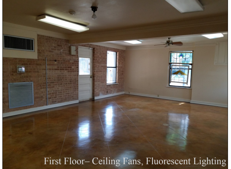
First Floor- Ceiling Fans, Fluorescent Lighting