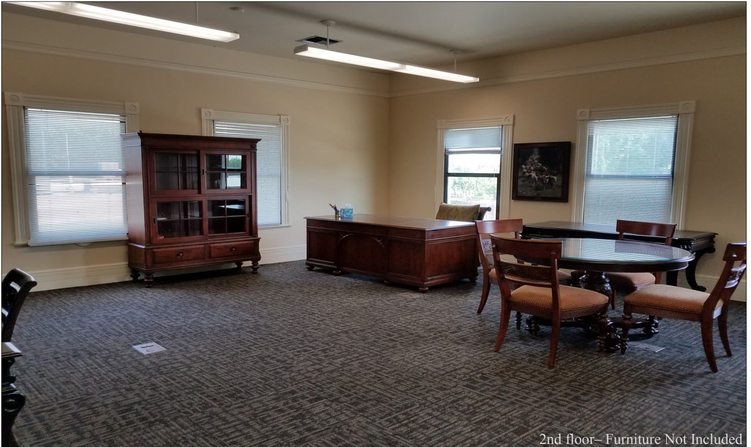
2nd floor– Furniture Not Included