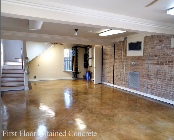
First Floor- Stained Concrete