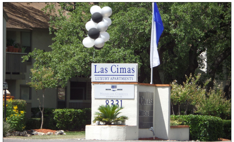
Entrance 83331 Fredericksburg Rd.