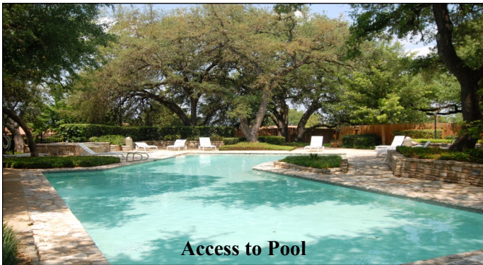
Access to Pool