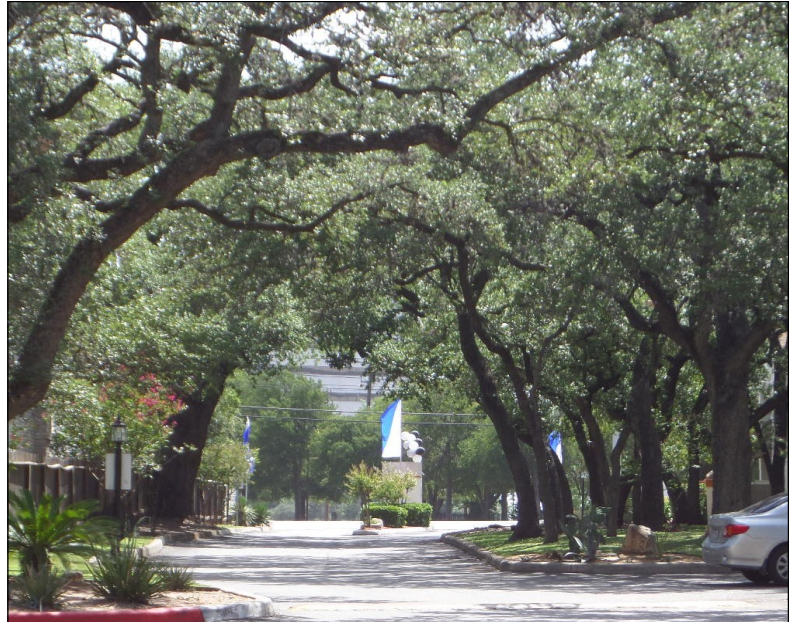
View From Building to Entrance at Fredericksburg Rd.