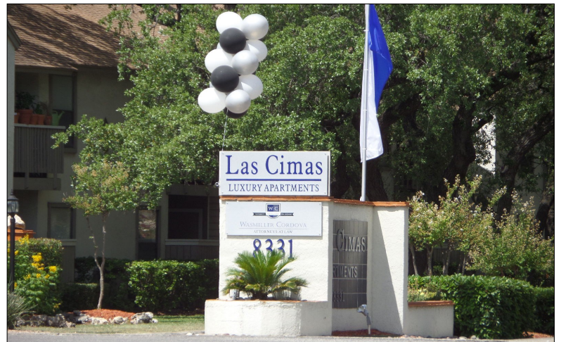
Entrance 83331 Fredericksburg Rd.